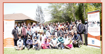
Kituo Staff and Paralegals who attended pose for a group photo after the Summit

While giving his keynote address, Okiya Omtatah an activist and human rights defender encouraged the paralegals to teach communities about the law since this was a key tool in the fight against human rights violations. He advised the participants to always use avenues that are likely to deliver results. “As paralegals you should have tools of documentation to record injustices. Never be afraid of doing the right thing, choose your fights carefully, be diplomatic and create connections. Most important equip yourselves with knowledge.” Said Omtatah.