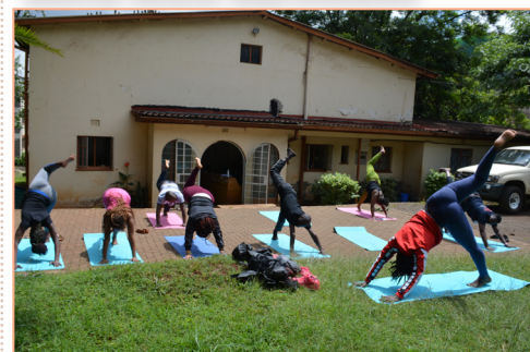
Kituo Staff during the YOGA session at the Head Office

Kituo Cha Sheria’s Mental Health & Psychosocial Support (MHPSS) team conducted Staff care YOGA session to the Head Office staff at the Kituo gardens.