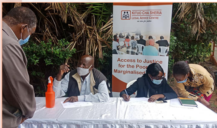
Kituo staff register clients as they come to the free legal aid clinic at Kituo Head office

Kituo Cha Sheria held a one-day free legal aid clinic on 10th December 2020 at the Kituo Cha Sheria Gardens to commemorate the International Day of Human Rights.