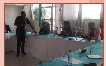
Volunteer advocates who participated in the training in Kajiado

Hall on 17th November 2020. Most of the clients we attended to and screened learnt of our free legal aid services from posters that had been circulated in Kittingela town. Some of them had been invited by advocates who we had recruited on 16th November 2020. We assisted the volunteer advocates in attendance screen the clients in filling our standard screening form. Notably, we did not receive any clients that were persons living with disabilities, a target group for Kituo Cha Sheria. The nature of the cases we noted upon screening the clients was diverse. We received mostly land cases and succession issues. This is because land is a critical issue in Kajiado County because most of the residents are pastoralists and practice agriculture. We also received clients with labour issues, one client with a criminal claim and 3 with commercial disputes. We were also able to share details on the M-Haki platform that we shared with our clients and explained how they could receive legal services through the free text message platform without having to travel long distances to get assistance