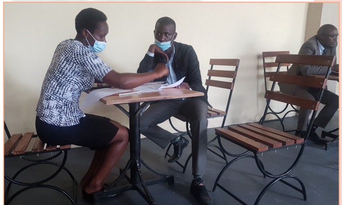
A client receiving legal assist from volunteer advocate during a legal aid clinic in Kittingela Kajiado