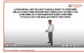
KITUO CHA SHERIA - Human Rights Part 2

Kituo Kituo cha Sheria through the support of GIZ produced four Video Logs (VLOGS) on human rights and Sexual and Gender-Based Violence. The videos were developed and disseminated on KITUO’s social media platforms including Twitter, Facebook, and Youtube.