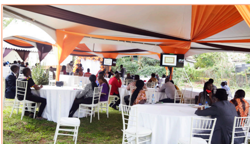
Participants follow proceedings from Live coverage monitors during the launch of the Strategic plan