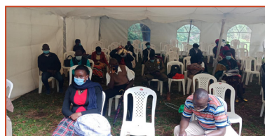
Clients waiting to be attended to by kituo advocates, paralegals and Volunteer advocates

Furthermore, KITUO increased awareness of its beneficiaries on various human rights issues. Clients who attended the legal aid clinic and needed to institute legal proceedings were issued appointments to be attended to by KITUO advocates.