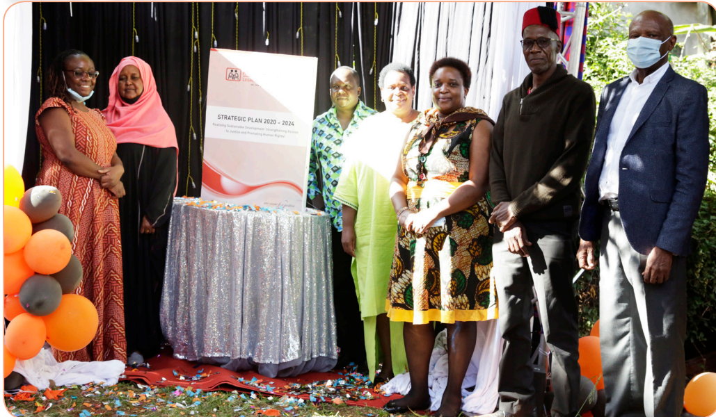
Kituo cha Sheria Board of Directors members with invited guests at the launch

Kituo Cha Sheria on 21st December 2020 launched its Strategic Plan at the head office grounds. The new plan is themed ‘Realizing Sustainable Development: Strengthening Access to Justice and Promoting Human Rights’ and will run from the year 2020 to 2024. This new roadmap seeks greater realization of the United Nations Sustainable Development Goal No. 16 on access to justice at national, regional, and international levels.