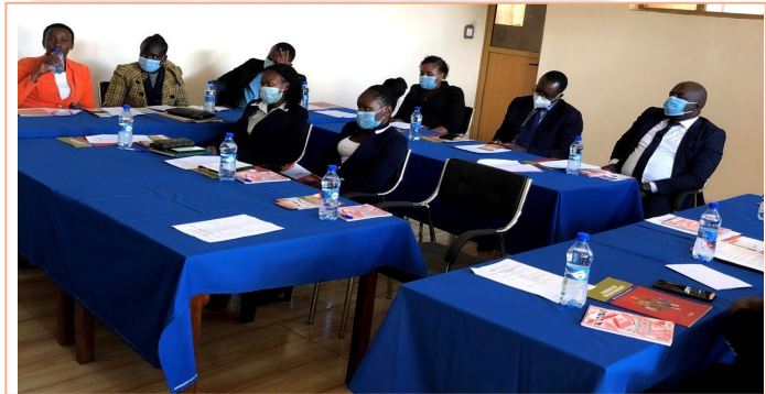
Volunteer Advocates during Volunteer Recruitment and Training Workshop

Kituo Cha Sheria through the Legal Aid and Education Programme (LAEP) conducted a legal aid clinic and volunteer advocates recruitment drive in Kitale, Trans Nzoia County. The LAEP team in conjunction with the recruited volunteer advocates and the Catholic Kitale branch conducted a free legal aid clinic at the Kitale Catholic Church. 20 community members presented their legal