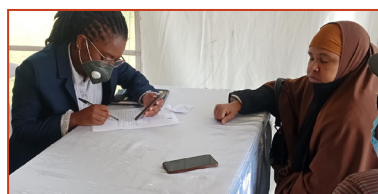
Kituo advocates attend to clients during the legal aid clinic held at kituo grounds