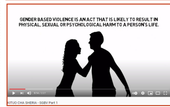
KITUO CHA SHERIA - SGBV Part 1