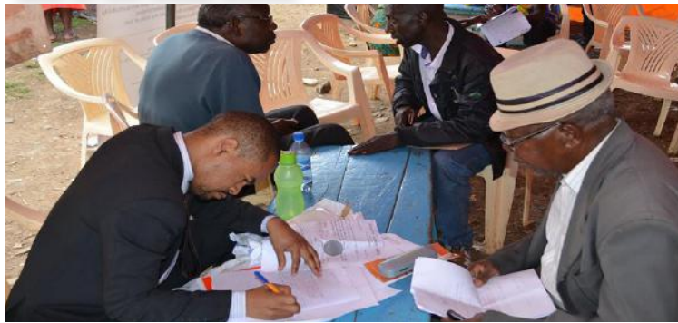
A Kituo volunteer advocate attends to clients during the clinic at Korogocho

H on. Jeremy Corbyn, leader of Labour party of the U.K ones said that “Legal aid is fundamental to giving everybody in this country access to Justice”.