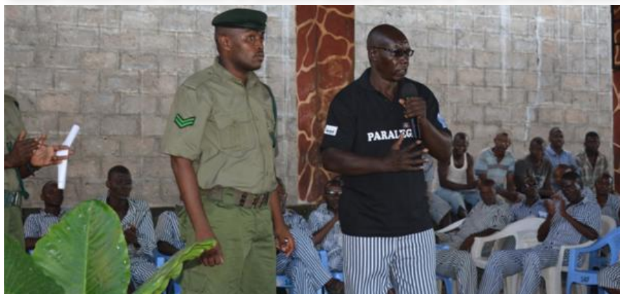
An inmate paralegal addresses other inmates as a warder looks on during the celebrations

Kituo Cha Sheria on 19th of December, 2016 joined Shimo La Tewa main prison in celebration of Access to Justice day.