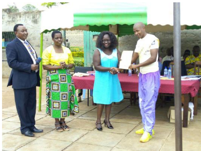
The Executive director presents a certificate to one of the participants after the training