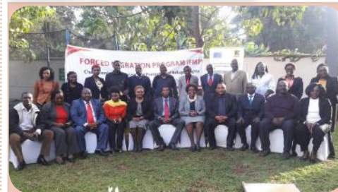
Participants pose for a group photo after the Court Users Committee (CUC) Training in Meru County

Kituo Cha Sheria through the Forced Migration Programme held one day Court Users Committee (CUC) training on 17th November 2016 at Alba Hotel in Meru. The event was a sensitization forum on refugee rights, emerging issues as well as access to justice for refugees and asylum seekers.