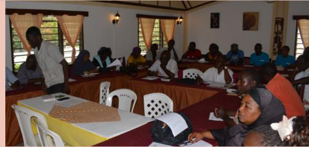
Participants during the Mhaki market research in Kilifi Town, Kilifi County