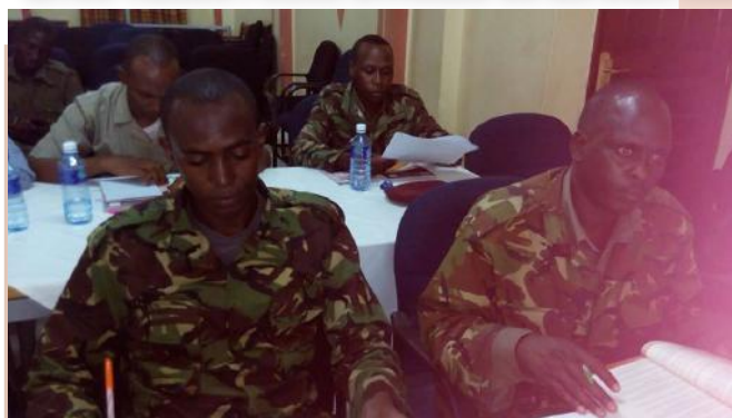
Some of the Police Officers during the training in Thika, Kiambu County

Kituo Cha Sheria through our Forced Migration Programme (FMP), in collaboration with the Refugee Affairs Secretariat, the International Rescue Committee and UNHCR KENYA in 2016 conducted police officers' training on refugee law in various parts of the country.