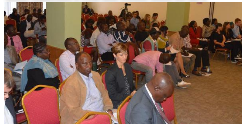
Participants during the Kinamba film and Comic book launch at the Panafric Hotel, Nairobi

On 2nd December 2016 at the Panafric Hotel-Nairobi, Kituo cha Sheria launched 'Just How Long'- a Short film on IDPs and 'Real Talk-This can happen to anyone of us' a comic book.