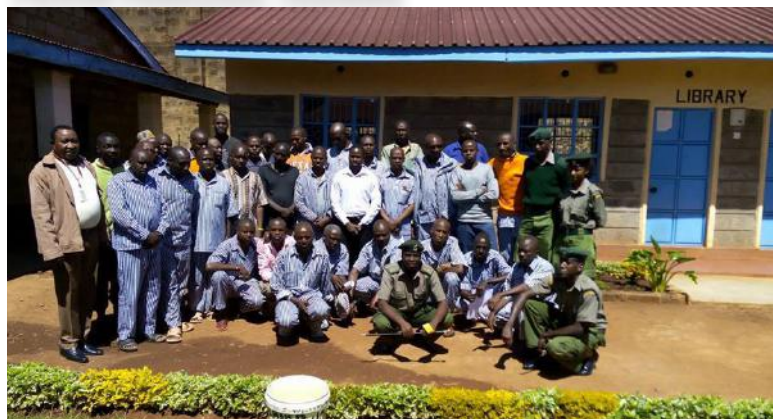
A group photo of Kituo staff, Prison warders and inmates after the paralegal training in Nyeri GK Prison

In its mission to enhance strong networking and collaboration with Kenya Prisons Service, Kituo successfully launched two prison justice centers, one at Nyeri Main (Kingongo) GK Prison and another at Kakamega G.K. prison to advance access to justice.