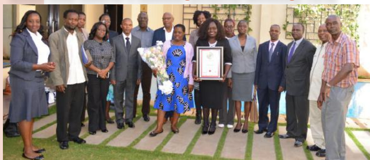
Members of the AGM and Kituo staff pose for a group photo after the meeting

Kituo held her 2016 Annual general Meeting (AGM) on 15th December, 2016, at the Amber Hotel, Nairobi. The annual event brought together Members of the Kituo AGM including the Board of Directors, Program heads and representatives of staff.