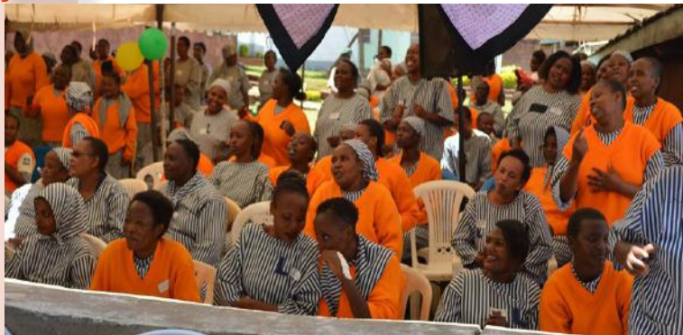
Inmates who took part in the Access to Justice day celebrations