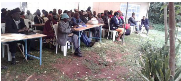
Clients who attended the free legal aid clinic waiting to be served at the tent at the Kituo Head Office

from the Kamukunji Police Station who explained the role of the police in the justice system to the participants. The activity was also attended by representatives from; International Justice Mission (IJM), National Organization of Peer Educators (NOPE), Local Administration, Ward Administrators, Probation office Makadara, Nyumba Kumi (Security at the village level) and the resident association.