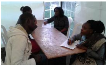
Kituo Lawyer and a Volunteer Advocate attend to clients during the free legal aid day at the Head office

Kituo advocates and volunteer advocates attended to and advised over 130 persons with labor, land, housing and human rights' legal issues.