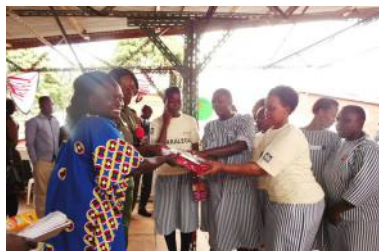
The Executive Director delivers stationery to Paralegal inmates for use in the Prison Justice Center

The Inmates were also empowered on various ways of accessing quick dispensation of justice with emphasis on fundamental human rights, legal representation and the judicial procedures.