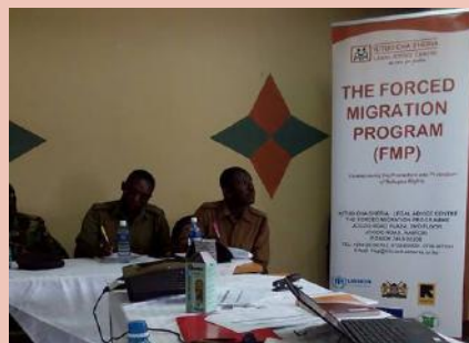
Attentive Officers during the training in Moyale, Marsabit County

The trainings were meant to build the knowledge and capacity of police officers on how to handle forced migrants. This noble endeavor involved officers drawn from different police units including; the Kenya Police, GSU, DCI and Administration Police.