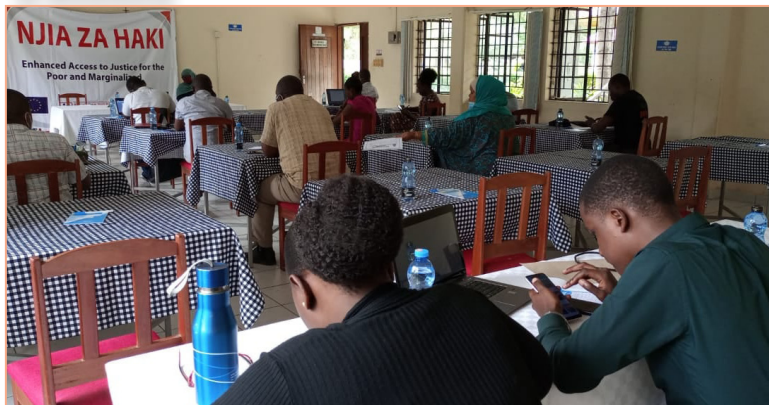
Members of the non-state actors on land during their consultative meeting at Tudor Pastoral Centre

On 12th February 2020 the non-state actors on land held a consultative meeting at Tudor Pastoral Centre to review advocacy and legal strategies on the matters touching on collective Public Interest Litigation, including the Mombasa County regeneration of the County Houses, the matter of Mwamdu public land and Mwakirunge dumpsite.