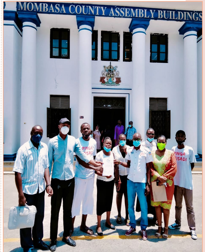
The Coast Civil Society Reference Group pose for a group photo outside the Mombasa county Assembly

Kituo cha Sheria was part of the team that presented a memorandum to the County Government of Mombasa on 24th February 2020.