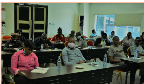
Attentive paralegals during the refresher training

The training was organized by Kituo's Advocacy Governance and Community Partnerships Programme supported by the Ministry of Foreign Affairs of the Kingdom of Netherlands under a joint objective to promote access to justice for the poor and marginalized.