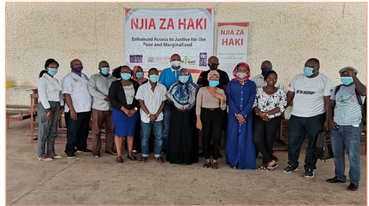
Members of the Governance Network, under the Coast Civil Society Reference Group pose for a group photo after their meeting.

On 2nd February the Governance Network, under the Coast Civil Society Reference Group held a meeting supported by Kituo Cha Sheria to review strategies for civic engagement and access to justice in the Coast region.