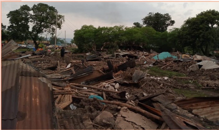
The Kibos community houses in ruins after a forceful eviction

The Kibos community in Kisumu County can now breathe a great sigh of relief after a Court allowed them to return to the disputed land and to erect temporary structures for their shelter.