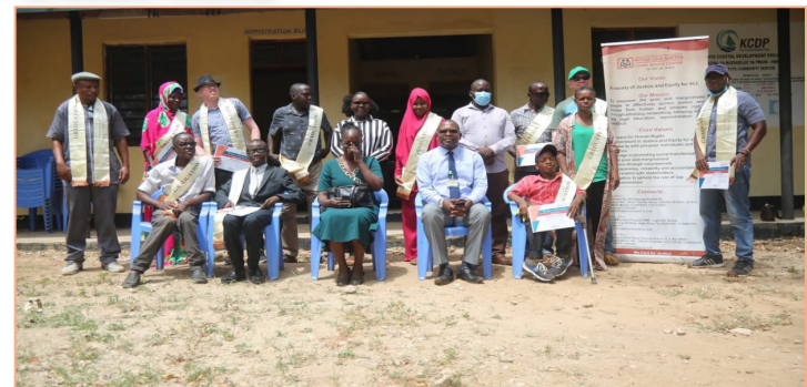
A group photo of the paralegals, Kituo board member, and kituo staffs at the Mtakuja Adult Centre in Kwale County

Congratulations to our community paralegals in Kwale County for successfully completing their training on 5th February 2020 and joining our network of paralegals.