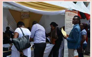
Members of the public at the Kituo cha Sheria tent at the Milimani Law Courts during the annual legal Awareness week

with the legal issues presented including Family/Maintenance; Succession; Labour; Human rights; Divorce/Family; Land; Civil; Business Disputes; General Legal Inquiries; Medical Negligence and Criminal matters. The week-long activity was successful as clients were received, screened and advised on the spot while some of the new clients were referred to Volunteer advocates. The annual LSK legal Awareness week comprises of various activities geared towards promoting access to justice, advocating pro bono legal services and legal aid. The Legal Expo saw Kituo join other organizations in showcasing their work and role played in the advancement of legal literacy and advocacy. For the entire week Kituo lawyers were stationed at the event where they were offering pro bono services to clients. Kituo's Mombasa Office also took part in this annual activity in Mombasa at the Mombasa Law Courts.