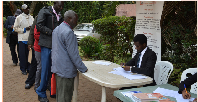
Clients at the registration desk on arrival for the FREE legal aid clinic and awareness forum at the Head Office in Nairobi

K ituo Cha Sheria successfully conducted a FREE legal aid clinic and awareness forum at its Head Office in Nairobi on the 5th September 2019 in an event that started early in the morning with clients arriving from different parts of the country.