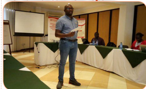
A speaker leads a session during the Malindi Salt Belt report validation workshop

On 13th September 2019 Kituo Cha Sheria's Mombasa Regional Office held a meeting in Mombasa that was meant to assess a scientific report that was prepared following complaints registered on violations around Land, Environment and trumped up charges against poor locals meted by the State and salt firms in the area.