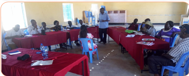
A trainer takes participants through a session during the refresher training for paralegals at the Turkana Community Justice Center in Lokichar, Turkana County

Kituo conducted a 5-day refresher training for paralegals at the Turkana Community Justice Center in Lokichar, Turkana County. The activity which started on Monday, 16th September 2019 closed on Friday, 20th September 2019 and