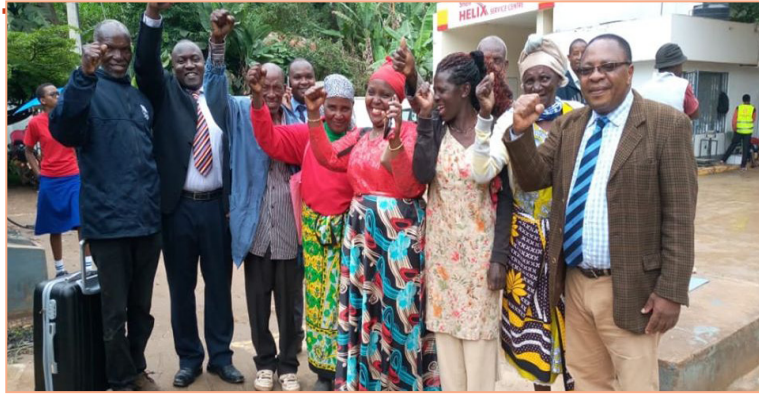
Jubilant community members in Taita Taveta and their advocate outside the Wundanyi Law Courts after the victory

24th October 2019 marked a victorious end to an eight-month-long legal battle between community members in Taita Taveta through the Taita Taveta Human Rights Watch, and the Kenya Wildlife Service. In February this year, four community members (three women and one man) in Wundanyi were arrested and charged with incitement to violence and destruction of the property of Kenya Wildlife Services.