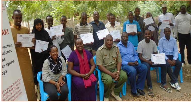
The trainees, Imarisha Haki project officers and prison officers pose for a group photo after the UN Standard Minimum Rules for the Treatment of Prisoners Training at the Garissa Main prison

K ituo Cha Sheria conducted a comprehensive UN Standard Minimum Rules for the Treatment of Prisoners Training at the Garissa Main prison. The training for Kenya Prison Officers at the Garissa Main Prison in Garissa County took place from the 14th to 18th October 2019.