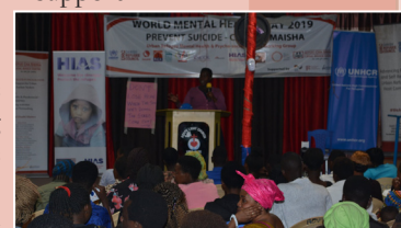
A speaker at the World Mental Health Day event focusing on suicide prevention and the role of the community in identifying and preventing suicide

With mental health issues being so widespread in the population, it is extremely important to raise awareness, support those around you that are suffering from a mental health problem, and to seek help if you feel you are suffering from any form of mental illness or mental health problem. Kituo believes that a greater awareness goes a long way in contributing to identifying and helping those in need, and breaking down the social stigmas and barriers to support.