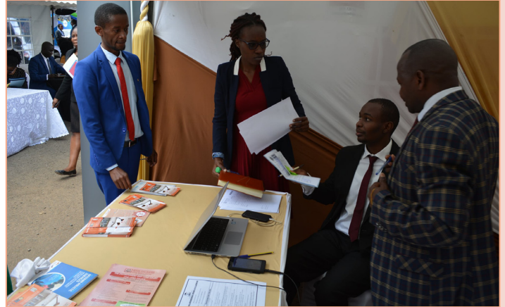
Kituo Cha Sheria's team consults during the LSK legal awareness week 2019 at the Milimani Law Courts

Kituo Cha Sheria took part in the LSK legal awareness week 2019 at the Milimani Law Courts from the 28th October 2019 till Friday, the 1st November 2019. Kituo cha Sheria- KITUO had been invited by the Law Society of Kenya (LSK) to participate in the annual LSK Legal awareness week. The event took place from the 28th October 2019 to 1st November 2019. The theme of the said Legal awareness week being "Eradicating Gender Based Violence- A focus on Mental Health". The week's events started off with speeches on Monday, 28th October 2019 with speakers speaking on this year's theme- "Eradicating Gender Based Violence- A focus on Mental Health". KITUO thereafter set up tent strategically ready to receive clients who presented various legal issues to the legal officers present. Legal officers, legal interns, legal assistants, RCKM personnel, Forced Migration Program and volunteer advocates attended the legal awareness week. Throughout the five (5) days KITUO was able to showcase its innovative SMS technology known as M-Haki, that allows where members of the public to text legal question at no fee. The questions are responded to by volunteer advocates and Kituo lawyers. Kituo also recruited Volunteer Advocates into the VA scheme- 50 new advocates joined KITUO's scheme with majority of the advocates based in Nairobi County but we also registered advocates from other towns like Nanyuki, Machakos, Kajiado, Ngong, Kiambu and Kilungu. 30 clients were served