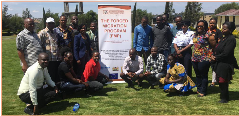
Participants pose for a group photo after the two-day training of government officials in Kajiado on Refugee Laws and Protection at the Enchula Resort, Kajiado

Kituo Cha Sheria with the support of partner organizations UNHCR, International Rescue Committee (IRC) and Refugee Affairs Secretariat (RAS) conducted a two-day training of government officials in Kajiado on Refugee Laws and Protection. The activity was held on the 11th and 12th September, 2019 at Enchula Resort, Kajiado.