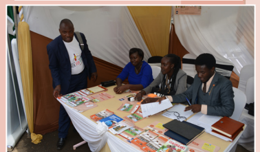
Kituo Staff members with publications at the Milimani Law Courts during the annual legal Awareness week