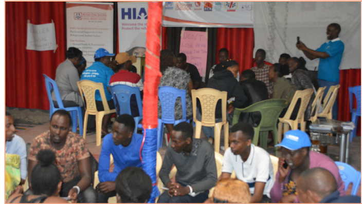
Participants share ideas during breakout sessions at the World Mental Health Day event at the Agape Light Church in Umoja III, Nairobi

Kituo Cha Sheria through its Mental Health and Psychological Support program on Thursday, 9th October 2019 joined the world and partner organizations dealing with refugees in marking this year's World Mental Health Day with suicide prevention being the main focus of this year's event to highlight the role of the community in identifying and preventing suicide. The event took place at the Agape Light Church in Umoja III, Nairobi. The day which was set aside by the World Federation for Mental Health was first celebrated in 1992 and aims to educate and raise awareness of mental health issues.