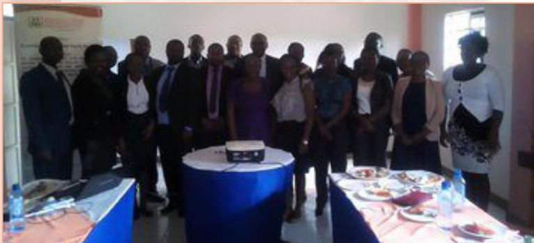
Volunteer Advocates and Kituo cha Sheria Staff pose for a group photo after the recruitment drive and training workshop for advocates in Kisii Town, Kisii County

Kituo Cha Sheria on Monday, 30th September 2019 conducted a Volunteer Advocates Drive and Training in Kisii County. The recruitment drive and training workshop for advocates preceded a FREE legal aid clinic in Kisii Town, Kisii County held on Tuesday, 1st October 2019.