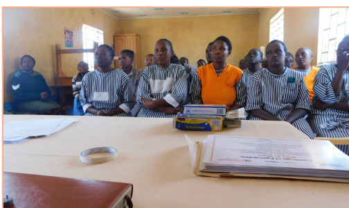
The female prison trainees during a training session at the Naivasha Women's Prison

Kituo has been conducting such trainings in different prisons throughout the country in order to ensure that prisoners understand their rights as prisoners while the prison officers are equipped with the knowledge, skills and attitude to perform their duties well and with respect for the rights and dignity of detainees which is in line with Kituo's pursuit of its vision of a society of justice and equity for all through legal empowerment.