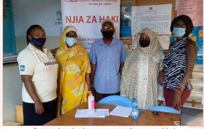
Participants during the video screening exercise at Kisauni primary School

Covid-19 pandemic. There was also a discussion on the role of paralegals in the Legal Aid Act, 2016. Paralegals will play a major role in the implementation of the Act and the CJCs will have to position themselves strategically. Kituo continues to support the operations of the CJCs.