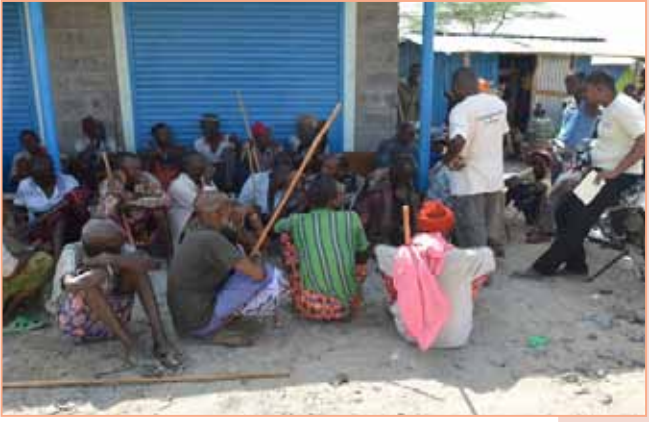
Kituo staff and residents during a fact finding mission in Marsabit county

Residents of Marsabit County petitioned the High Court, through Kituo Cha Sheria, to compel the government to intervene quickly to avert further spread of the cancer scourge to save the lives of both people and livestock.