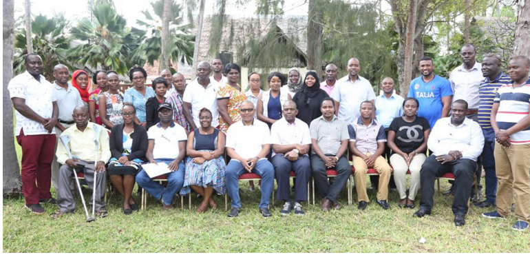
Kituo Cha Sheria officers together with a team of Sub-County and Ward Administrators from Mombasa County

Kituo Cha Sheria through the Coast Regional Office - Mombasa held a successful four day legal training to the first batch of Sub-County and Ward Administrators in Mombasa County. The legal training exercise was a collaborative initiative between the County Government through the Office of the County Attorney and Kituo Cha Sheria. The training which was held from the 22nd to 25th August 2018 covered the following topics; Administrative Law, the Law on Public Participation, Leadership & Integrity, Labour Law & Labour Relations, Policy Making and Project Formulation. Other training areas were on Constitutional Law, Human Rights Law, Gender Based Violence, Environmental Law, Budget Making Process, and Introduction to Law, Refugee Law and Alternative Dispute Resolution. The training sought to empower County officials on their legal obligations with a basis on how they should implement various laws governing residents and the County as well as handling community issues.