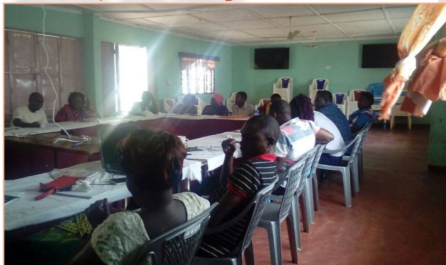
Paralegals from Kilifi County, Magarini Sub County undergoing the refresher training at the Marereni Community Justice Centre

Kituo through the Coast regional office - Mombasa. conducted three days intensive paralegal refresher training at the Marereni Community Justice Centre, Magarini Sub County, Kilifi County.