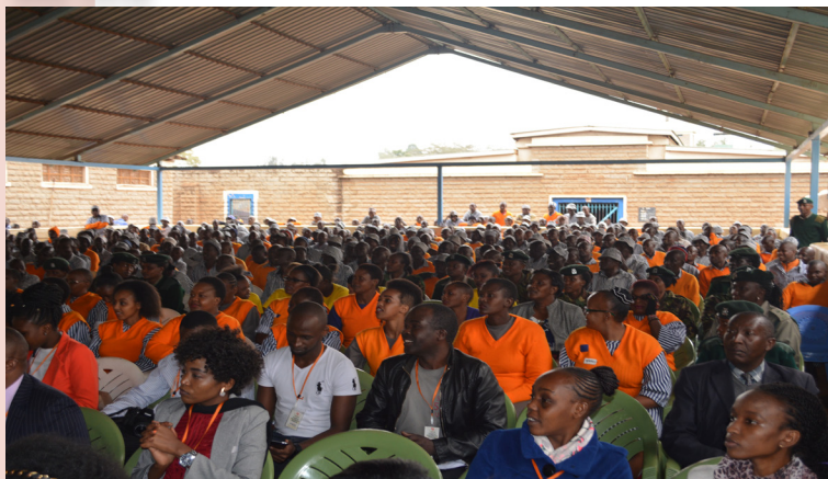
Guests together with the inmates following the proceedings of the day

Kituo Cha Sheria joined the world in commemorating the International Prisoners Justice Day marked on 10th August every year. The day that was celebrated at the Kamiti Maximum Prison brought together global citizens from all walks of life including inmates from various detention facilities, Human Rights organizations, law enforcement agencies and other non-state actors.