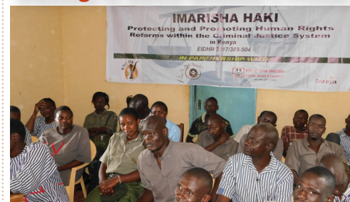
Paralegals and prison officers undergoing the refresher training

Kituo Cha Sheria on 4th, to 7th August conducted an intensive training for prison paralegals and prison officers from Busia Men and Women Prisons on Prevention against Torture Act among other human rights related topics.