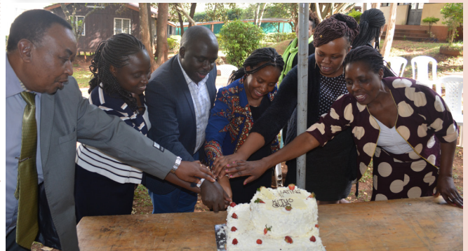
Kituo Cha Sheria staffs take position for the cake cutting ceremony

Kituo cha Sheria turned 45 on 9th July, 2018. This makes it the oldest legal aid institution in the Republic, boasting a nationwide presence and a significant contribution to the development of law. It's a remarkable status few could have predicted; not least the five young law students, who first carried its vision. Kituo Cha Sheria's vision is towards a society of equity and justice for all. Similarly, the mission of the organisation is to empower the poor and marginalized people to effectively access justice and enjoy their peoples and human rights in Kenya through advocacy, networking, lobbying, legal aid education and representation, research and innovation. Kituo Cha Sheria staff came