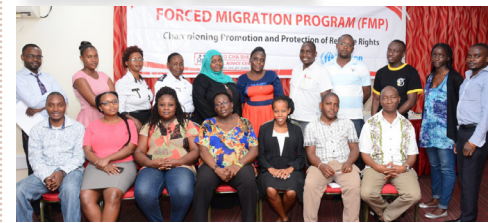
Kituo FMP, Mombasa office team together with Court Users Committee (CUC) members from Mombasa County

Kituo Cha Sheria through the Forced Migration Programme, Mombasa office conducted two (2) days training on Refugee Law with Court Users Committee (CUC) members on the 23rd and 24th August 2018 at Pride Inn Hotel, Mombasa.