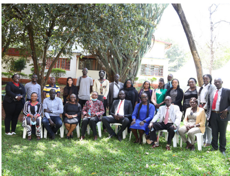
Group Photo of Kituo Staff together with South Sudan Human Rights defenders Network taken shortly after the meeting held at Kituo Head Office in Nairobi

In line with the vision to enhance our regional engagement on access to justice, Kituo Cha Sheria on 29th January hosted a team from the South Sudan Human Rights Defenders Network (SSHRDN) who visited on a benchmarking mission.