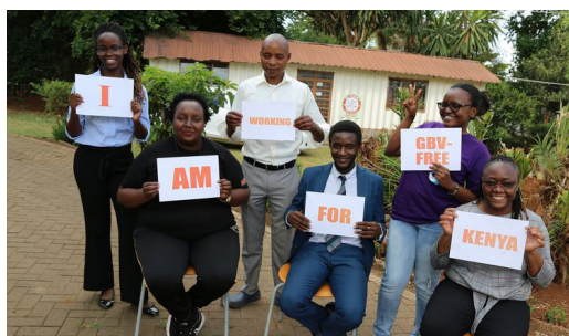
Kituo Staff take part in creating SGBV awareness

Kituo actively conducted a social media campaign to raise awareness on gender based violence and human rights. Kituo's social media platforms featured informative posts, infographics and videos on Sexual Gender Based Violence and human rights. The 16 days of activism campaign posts reached a total of 13,990 people and 7,902 engagements on Facebook while on Twitter 6,790 post reach and 2,044 engagements.