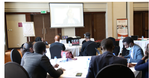
Participants following the proceedings at Crown Plaza Hotel

She emphasized that People-centred justice is a justice system that puts people at the heart of everything it embodies. This includes a Judiciary that allows people to be actively involved in access to justice. A Judiciary that is truly accessible, which meets the public needs and inspires confidence.