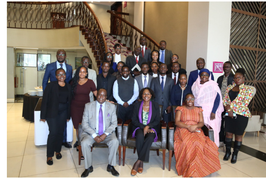
Group photo of the attendees shortly after the closing ceremony of the colloquium.