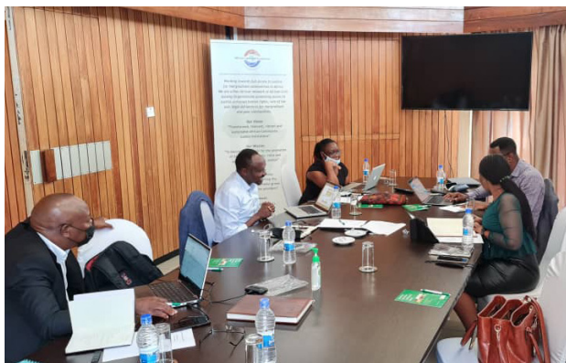
The Founding members of the African Centre of Excellence for Access to Justice during a meeting in Lilongwe, Malawi.

The founding members of the African Centre of Excellence for Access to Justice on 10th March 2022 convened in Lilongwe, Malawi for an in-person reflection and review meeting to chat the strategy for the Centre for the next two years.