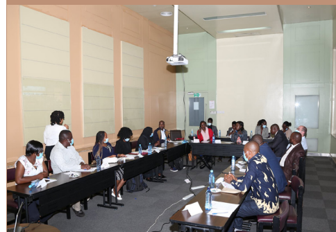
Members of Prison Sector Working Group together with Kituo staff during the engagement meeting held at the Best Western- Meridian Hotel Nairobi

Kituo Cha Sheria on 15th December 2021 held a consultative meeting with the Prison Sector Working Group to discuss the electoral preparedness and gaps in the participation of inmates in the 2022 general elections.