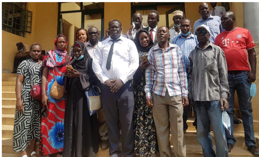
Group photo: Kibos Nubian Community members together with Kituo staff and Volunteer advocates at the Milimani Court Kisumu

Kibos Nubian Community members can now breath a sigh of relief after Justice Ombwayo dismissed the application by the Kenya Railways to stay execution of a judgment delivered in favor of the Kibos community. Justice Ombwayo upheld the judgment delivered in August 2021 in favor of the community paving way for the Kibos community to now seek full compensation for their injuries and losses in the civil court.