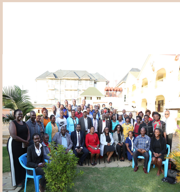
Group Photo: Kituo Cha Sheria staff together with AJS Paractitioners and members of the National Steering Committee on the Impelementation of the AJS Policy.

The project aims to foster forgiveness, reconciliation, and co-existence in counties that are susceptible to post-election violence. The project is currently in its third phase. In the first and second phases, Kituo Cha Sheria facilitated trust-building between host communities and survivors of the 2007/2008 post-election violence in Kenya.