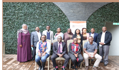
Group Photo: Members of Prison Sector Working Group together with Kituo staff

The meeting that was held at the Best Western- Meridian Hotel Nairobi also saw prison stakeholders discuss the challenges faced by prisoners in accessing justice, and how the digitization of the Judiciary has affected access to justice for the prisoners during the Covid -19 pandemic. Of special interest was the effectiveness of the court process in prisons during the covid-19 and the compliance of the Covid-19 protocol as well as devolving legal aid services to all 134 stations