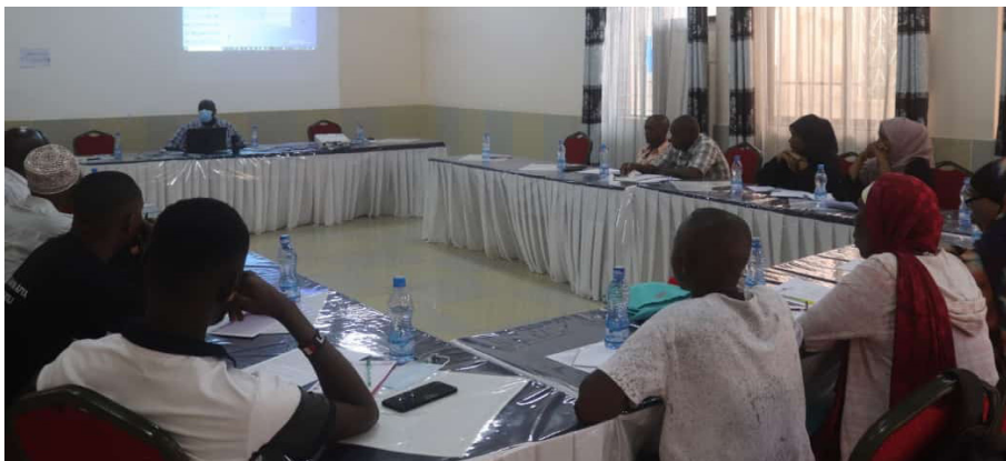
Community paralegals in Mombasa undergoing mediation training at White Rhino hotel in Mombasa

Kituo Cha Sheria in collaboration with the Mediation Training Institute (MTI) on 21st to 26th March 2022 took the Community Paralegals in Mombasa county through Mediation course at White Rhino Hotel in Mombasa. The training aimed at equipping Community Paralegals with ADR skills and inculcate the spirit peaceful resolution of disputes.