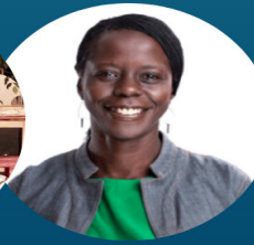
Atieno Odhiambo Legal Empowerment Fund