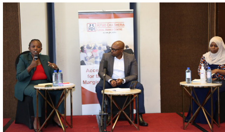
Jedida Wakonyo Waruhiu, Commissioner of the National Steering Committee on Implementation of AJS Policy (left) making her contributions.