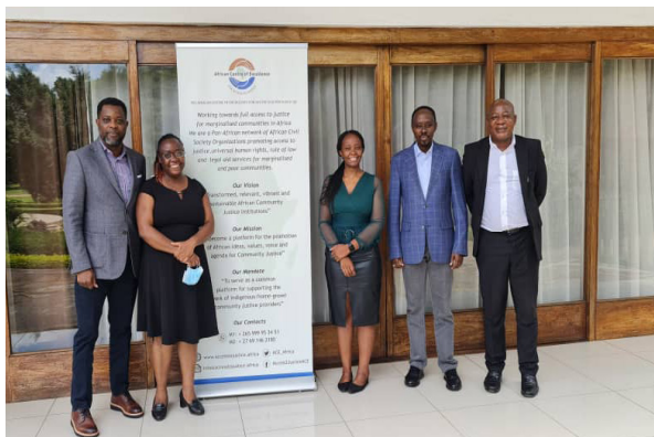
The Founding members of the African Centre of Excellence for Access to Justice pose for a group photo shortly after their meeting.