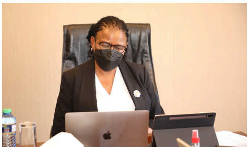
Hon. Justice Martha Koome, EGH Chief Justice & President of the Supreme Court of Kenya giving her key note address virtually at a VIP room within crown plaza hotel.

Kituo Cha Sheria with support from MISEREOR convened a Public Interest Regional colloquium with leading legal empowerment organizations in the East, Horn and Southern Africa region on the 7th and 8th of March 2022 to discuss and review the role of people driven Justice in Africa. The discussions were structured in the form of panel and plenary discussions highlighting the state and development of people-driven justice within the country, experience-sharing from other African jurisdictions and diverse actors within the access to justice chain.