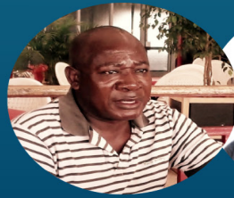
Clifford Msiska Africa Centre of Excellence for Access to Justice