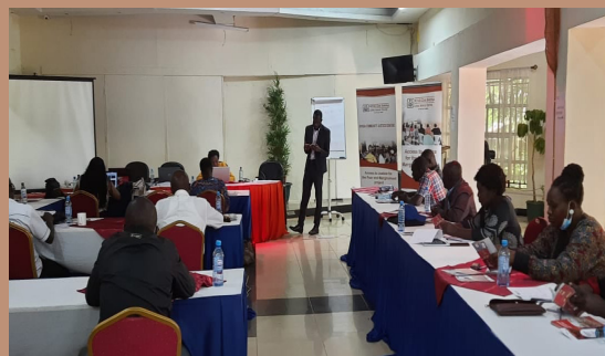
Kituo Cha Sheria Volunteer Advocate leading paralegals training at Rhodis Hotel in Vihiga County

With the new cases, developments in legislation and policies, paralegals need to keep updating their knowledge and skills to best operate. Kituo Cha Sheria on 21st – 26th of March conducted a Refresher Trainings for the Paralegals in Vihiga county.