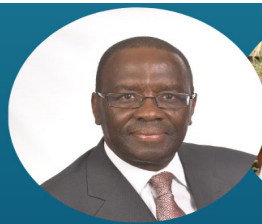
Dr. Willy Mutunga Ambassador for People Centred Justice