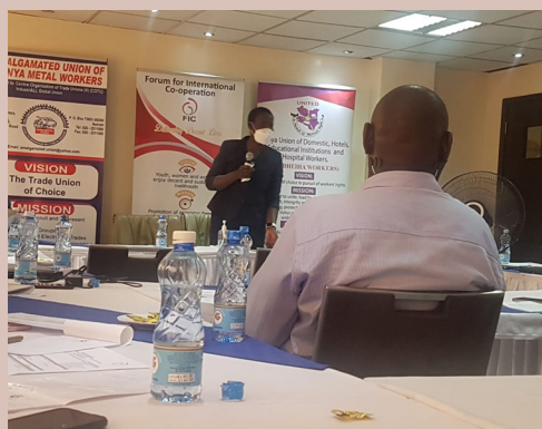
Hon. Lady Justice Maureen Onyango, Judge Employment and Labour Relations Court giving her key note speech