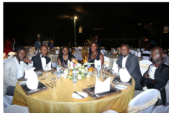
Kituo Cha Sheria Staff following the colourful LSK Annual Awards-2022 held on 25th of March, 2022 at the Safari Park Hotel, Nairobi.