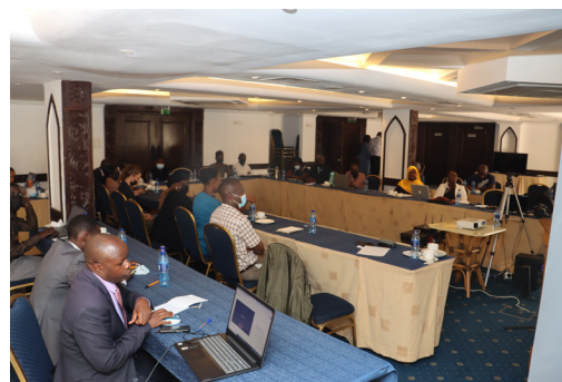
Participants following the proceedings during Inception workshop at Heron Portico Hotel in Nairobi.

The scope of the project will be Kenya and the entire East Africa region. Lessons from other parts of Africa on these three questions will be shared as best practices.