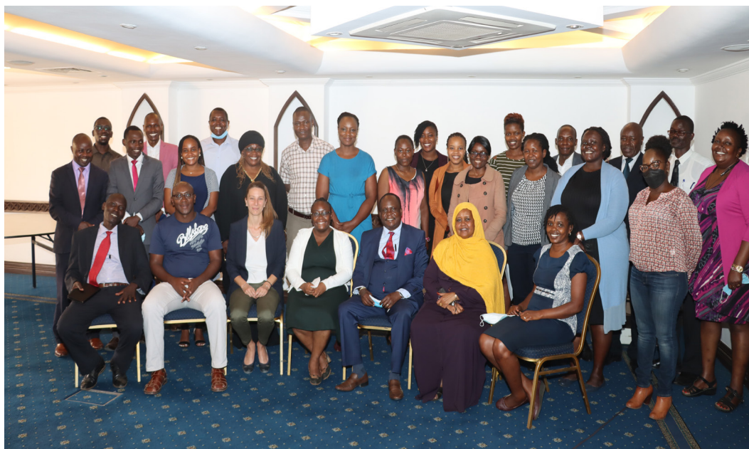
Group photo: Kituo Fraternity together with key stakeholders and partners who will be involved in the research project

Kituo Cha Sheria on 31st January 2022 conducted an Inception Workshop at Heron Portico Hotel in Nairobi, to kick-off a three-years research project that will evaluate the impact of legal empowerment programming, the use of technology within the justice sector during the COVID- 19 pandemic and formalization of paralegals through recognition, training, financing and accreditation. The virtual side event themed People-Centered Justice brought together paralegals, and organizations that support paralegals, from across Africa, policymakers, and state officials to continue a continent-wide conversation on how they can work together to support and bolster the important work of community-based paralegals.