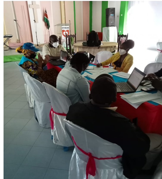
Kituo Staff together with officers from UNHCR, GIZ and RAS during the consultative meeting.

Therefore, it is crucial to incorporate the findings from this assessment during the programing course of 2022. This assessment will also serve as the baseline to measure gaps and examine to what extent these issues are responded to in the next assessment. The recommendations noted above will be worked on in the course of 2022 as part of efforts aimed at reducing protection risks and strengthening PoCs' capacities. The exercise was conducted in three major towns Nairobi, Mombasa and Nakuru.