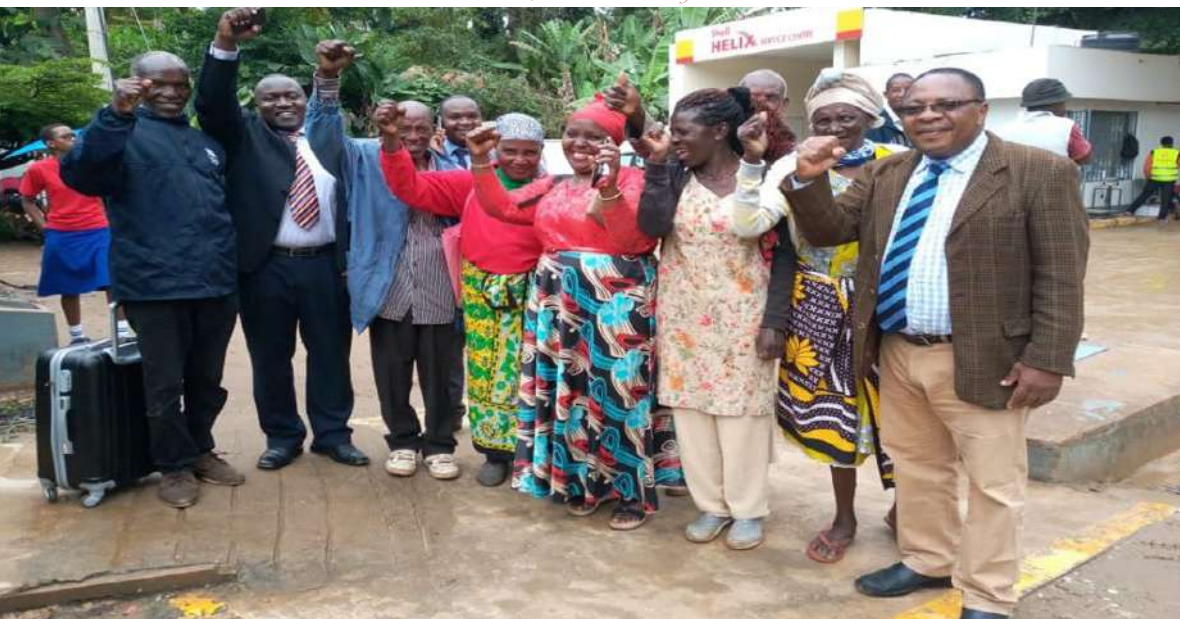
Jubilant community members in Taita Taveta County celebrate outside the Wundanyi Law Courts after the victory over Kenya Wildlife Service in a case they were represented by Kituo Cha Sberia

The Mombasa regional office in the year 2019 reports and continues to make progress in the realization of KITUO core mandate. The year in general was successful, this can be attributed to the hardworking and dedicated staff who went beyond the usual call of duty to execute their functions despite persisting challenges. It is this year that KITUO Mombasa office received funding from UNDP to implement Njia za Haki. The project was key in the achievement of KITUO mandate to the poor and marginalized. This was a major achievement for Mombasa Office.