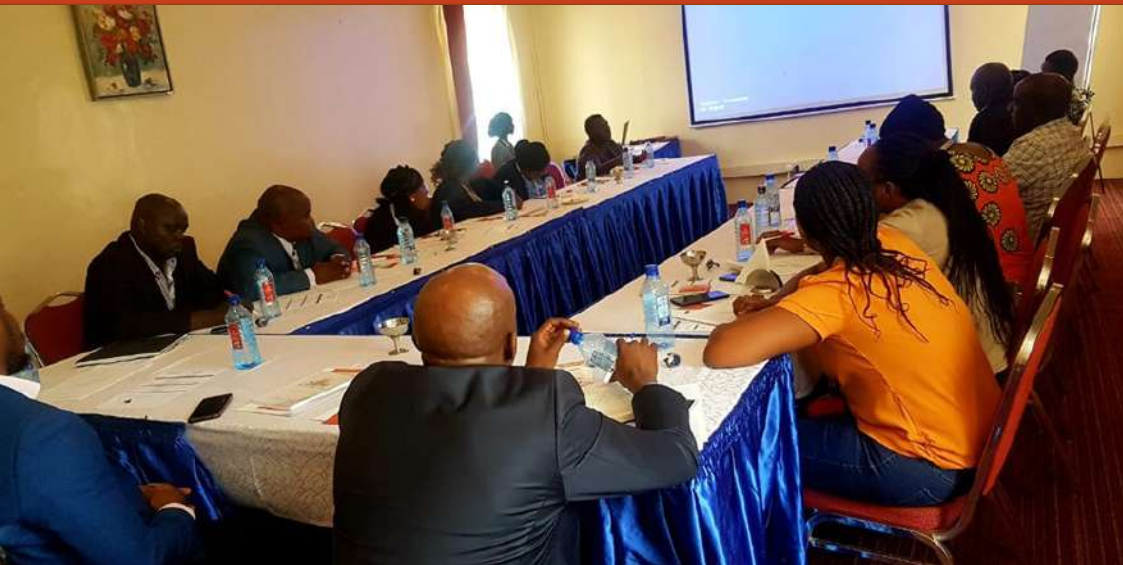
Police Officers during a session of the refugee law training at the Pride Inn Hotel-Westlands, Nairobi