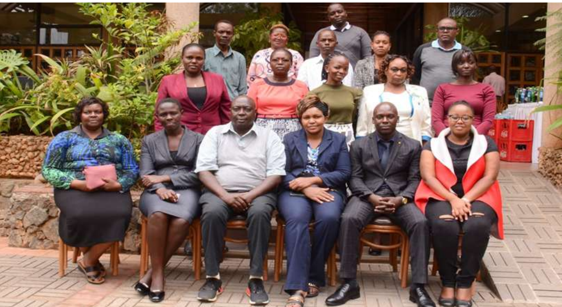
The Nakuru Court Users Committee (CUC) members pose for a group photo after a training and sensitization workshop at Merica Hotel, Nakuru

The Forced Migration Programme aims to protect and promote the rights of asylum seekers and refugees within urban areas. The program seeks to address policy and legal needs of refugees and asylum seekers with the objective of improving welfare of refugees and ensuring that they have access to justice.