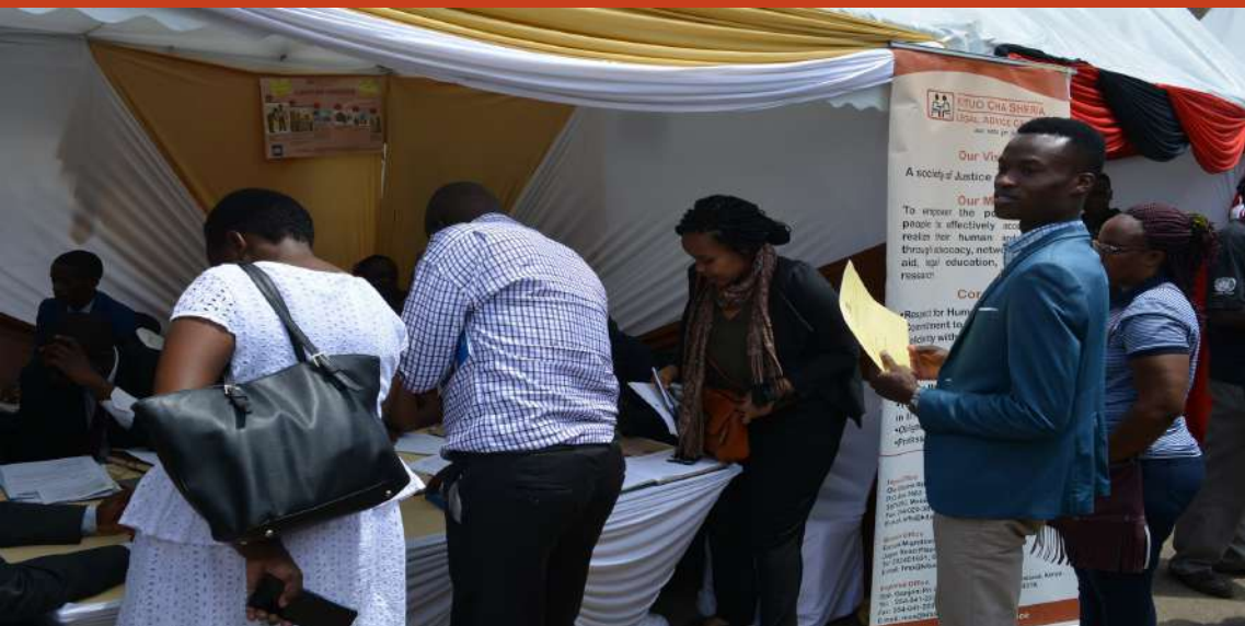
Participants visiting the Kituo Cha Sheria's stand during the LSK legal awareness week 2019 at the Milimani Law Courts

In celebration of the 46th anniversary, KITUO conducted a free legal aid clinic on the 5th September 2019 at the KITUO gardens in Nairobi.