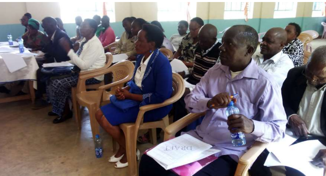
Members of the Community follow proceedings during the County Budget forum at the ABC Church Hall in Kitui town

The Legal Aid and Education Programme offers legal aid services to the poor and the marginalized in the core mandate areas of Land, Labour, Housing and Succession cases. The programme supports clients with advice for self-representation with the more complex cases being handled by Kituo advocates. Clients with matters outside our mandate areas are referred to partner organizations specialized in the various areas and to volunteer advocates.