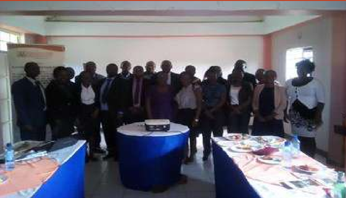
Volunteer Advocates and Kituo cha Sheria Staff pose for a group photo after the recruitment drive and training workshop for advocates in Kisii Town, Kisii County

Act, (2016) and how legal aid provides can harness the state funds under the Legal Aid ACT, 2016. The key resolutions of the training were to pursue accreditation of legal aid establishment of the fund channellin accredited as service providers and thereafter for the funds to be channeled to the advocates.