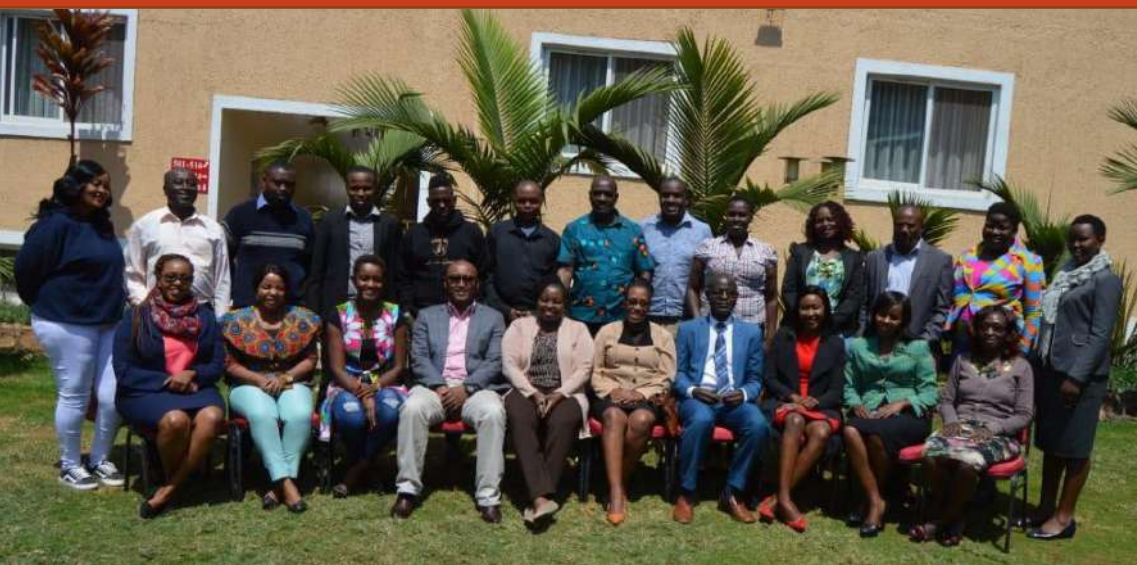
Nairobi Court Users Committee members pose for a group photo during a training workshop at the Pride Inn Hotel in Nairobi