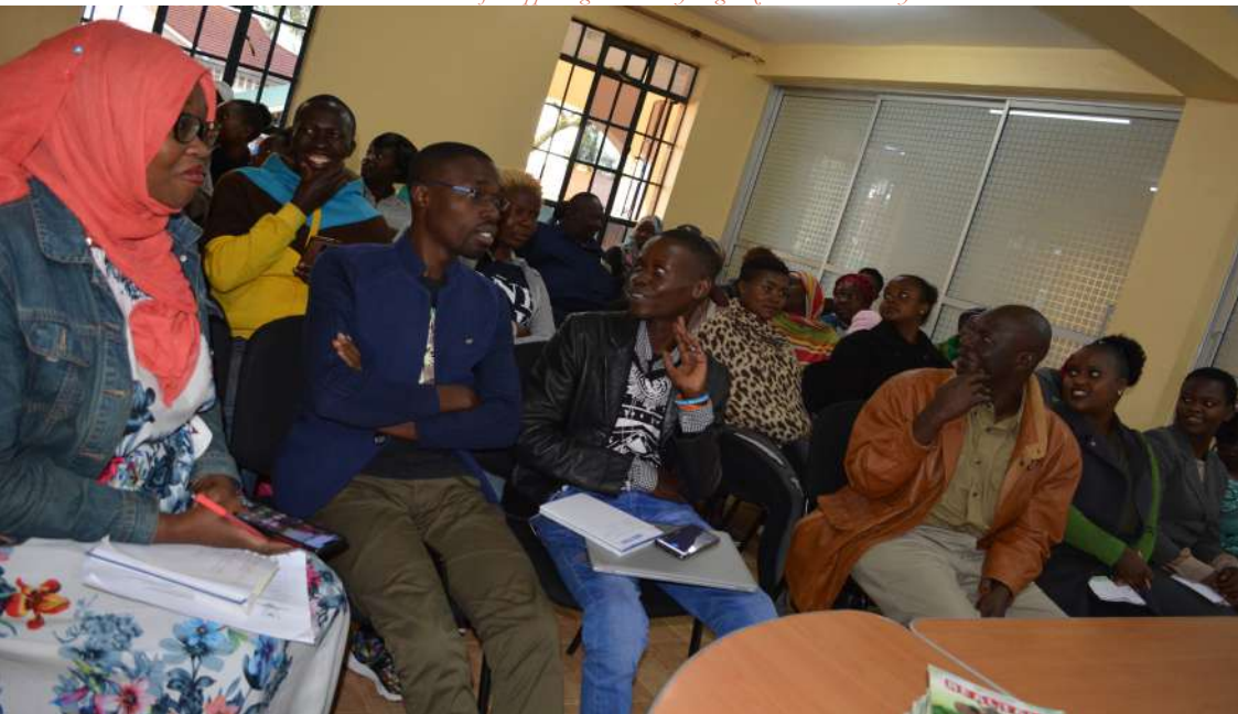
Participants keenly follow proceedings during the legal awareness forum on SGBV in Kibra, Nairobi organised by Kituo Cha Sheria