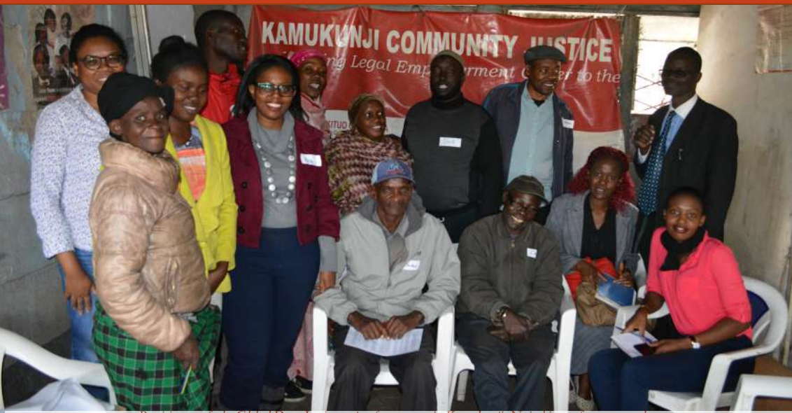
Participants of the Global Data Justice project focus group in Kamukunji, Nairobi pose for a group photo