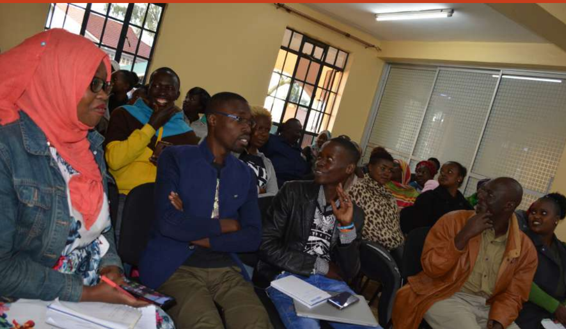
Participants keenly follow proceedings during the legal awareness forum on SGBV in Kibra, Nairobi