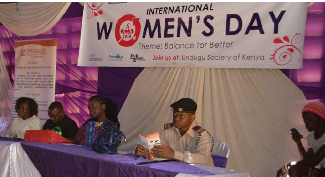
Participants following proceedings at the Undugu Society Hall in Mathare, Nairobi during the International Women's Day