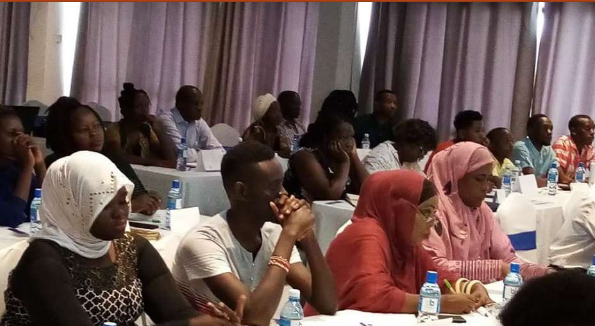
Community paralegals following proceedings during the Bi-annual Stakeholders Conference at the City Blue Hotel, Mombasa