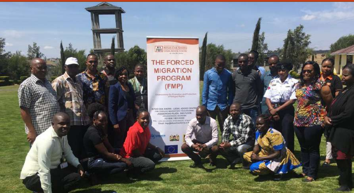
Participants pose for a group photo after the two-day training of government officials in Kajiado on Refugee Laws and Protection at the Enchula Resort, Kajiado