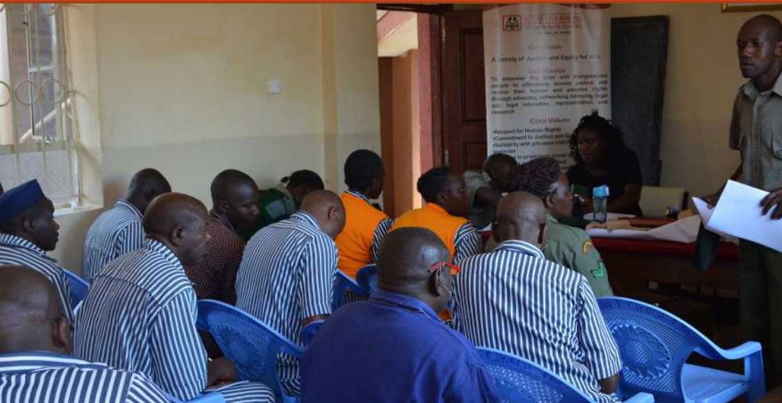
Prison paralegal attending a refresher training conducted by Kituo at the Nyeri GK Prison

The Advocacy, Governance and Community Partnerships Programme (AGCP) coordinates community outreach and advocacy initiatives by connecting people with the law and instruments of justice. AGCP ensures the involvement of the poor and marginalized in the promotion of good governance, formulation of enactment of pro-poor policies and laws that are in tandem with international standards, and therefore enhances the realization of access to justice for all.