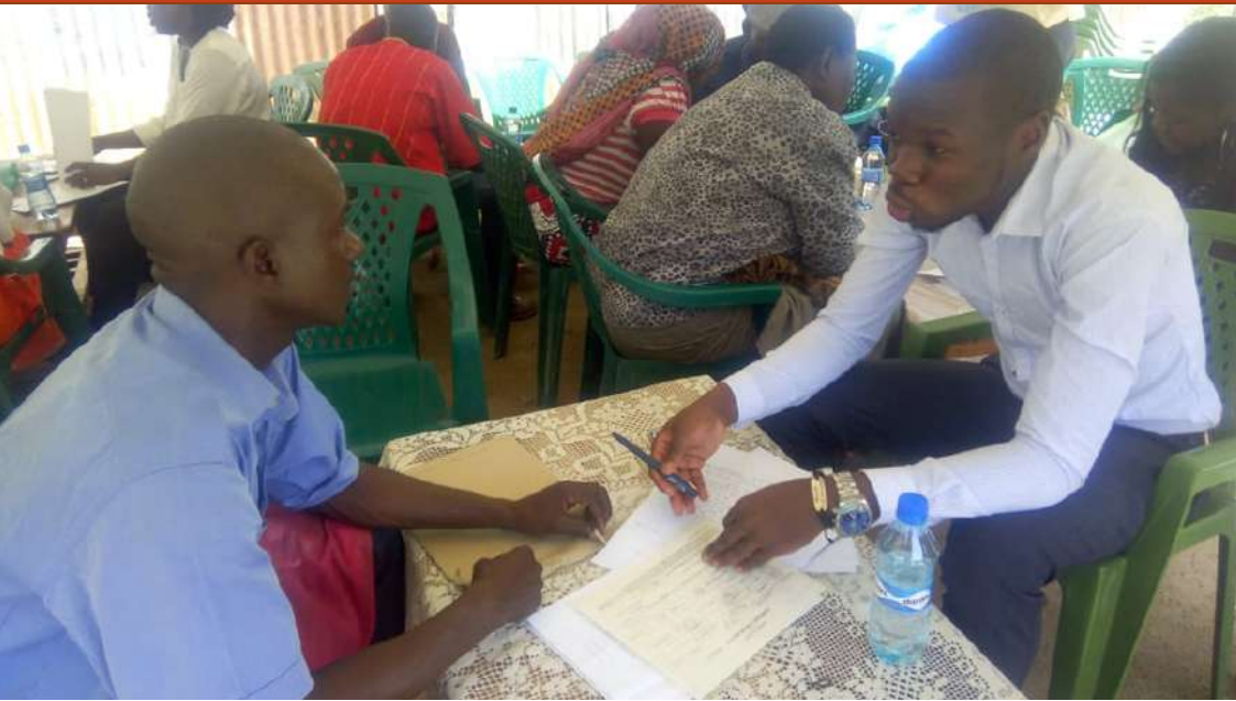
A Kituo Volunteer Advocate screens a client during the Legal Aid Clinics and Community outreach in Kisumu County