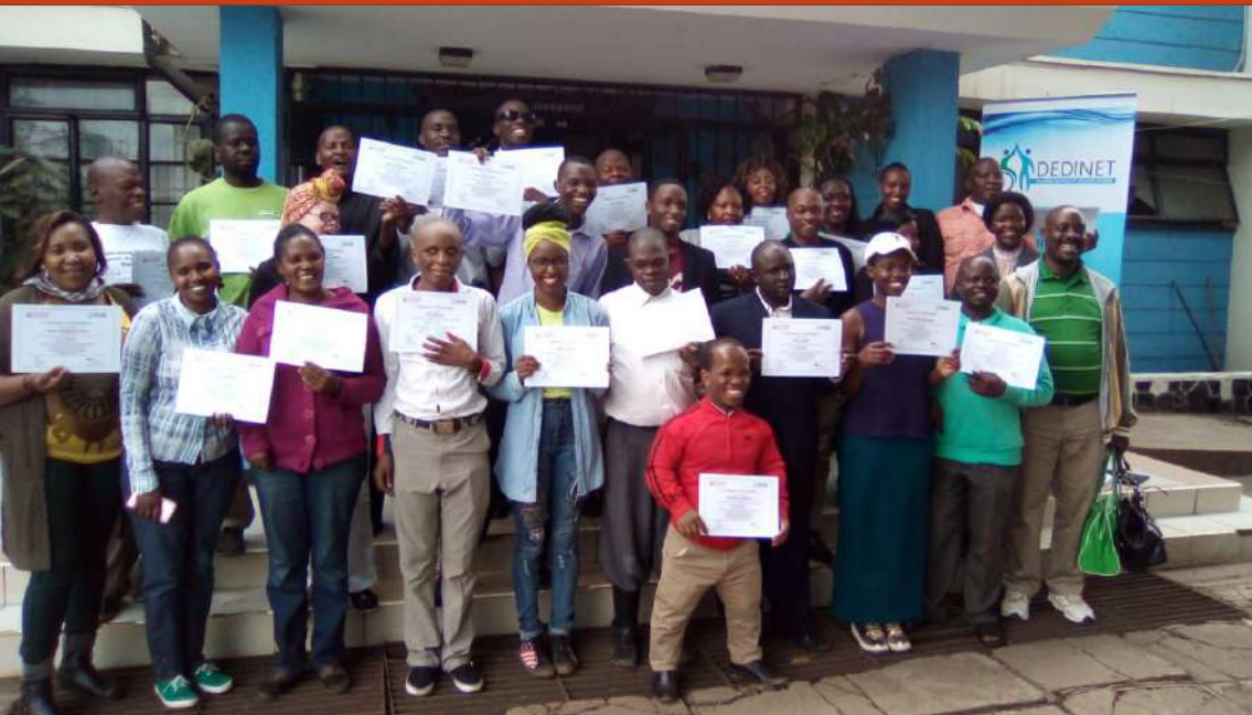
Participants of the paralegals for disabilities training workshop pose for a group photo with their certificates at Pompeo Place in Embakasi, Nairobi

Kituo Cha Sheria trained a group of 24 persons living with disabilities (PLwDs) in Nairobi. The paralegals for disabilities training workshop in partnership with the Kenya Union of the Blind (KUB) took place from the 3rd to 7th June, 2019 at Pompeo Place in Embakasi, Nairobi.