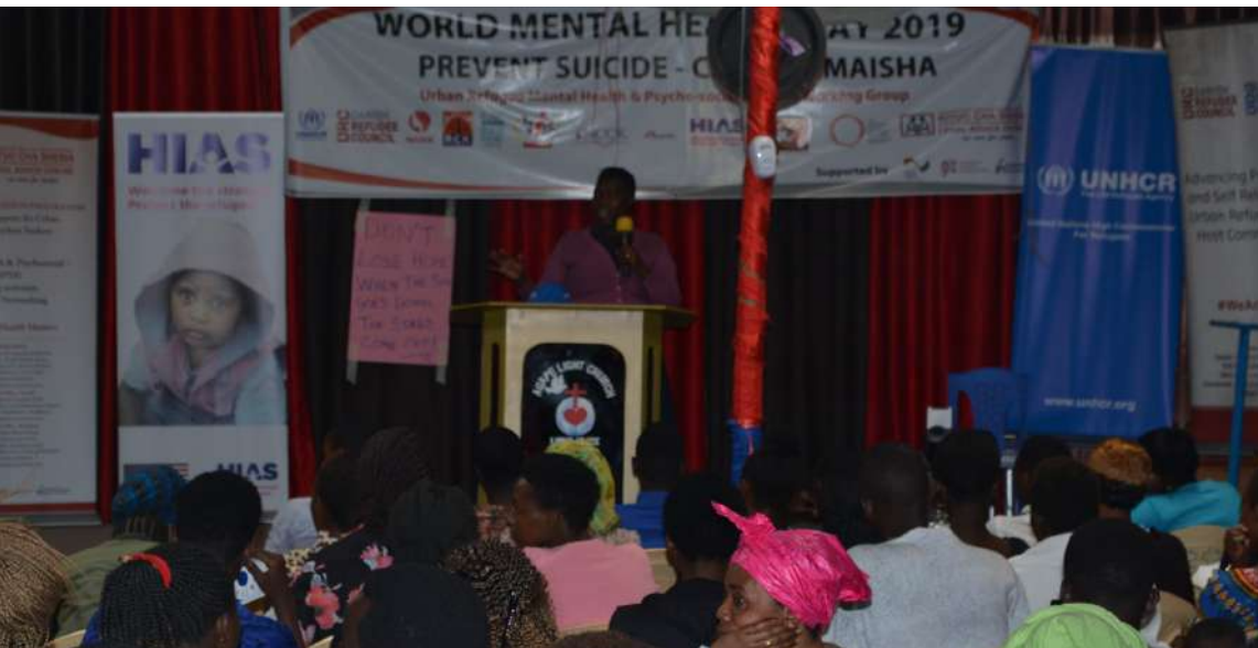
A speaker at the World Mental Health Day event focusing on suicide prevention and the role of the community in identifying and preventing suicide

We also managed to sensitize the officers in the various stations on refugee rights and refugee protection in Kenya and the different partner organizations providing the services and their contact information.