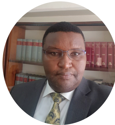
Justice Onesmas Makau