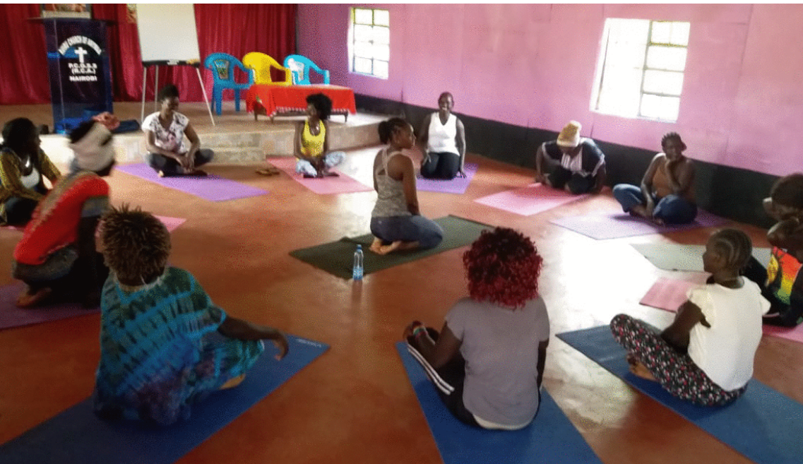
Members of the Refugees community during a yoga training session by Kituo's MHPSS in Ruiru, Kiambu County

refugees law and asylum seekers within the course of their daily duties.