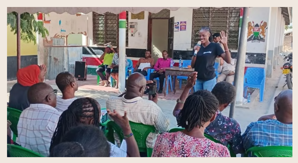
KITUO, Mombasa team, conducting Small Claims Court awreness in Nyali, Mombasa County

On March 25, 2025, KITUO actively engaged in community chief barazas in the Nyali and Changamwe regions, aiming to educate local residents about the Small Claims Court and its jurisdiction. This outreach effort followed a series of training sessions for National Government Administration Officers (NGAOs), who play a critical role in administering and facilitating local governance. The chiefs raised concerns about the community's limited awareness of legal resources like the Small Claims Court, prompting KITUO to extend its educational efforts through these influential community forums.