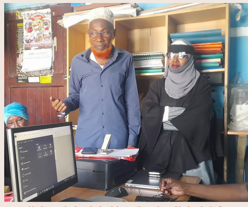
Mombasa paralegals conducting their normal operations at Mombasa Justice Centre

The meetings in Mombasa highlighted the critical role of community-based justice initiatives. These centres empower individuals—particularly the marginalized—to navigate complex legal systems. With ongoing support and strategic improvements, they can remain a beacon of hope and a driver of justice for all.