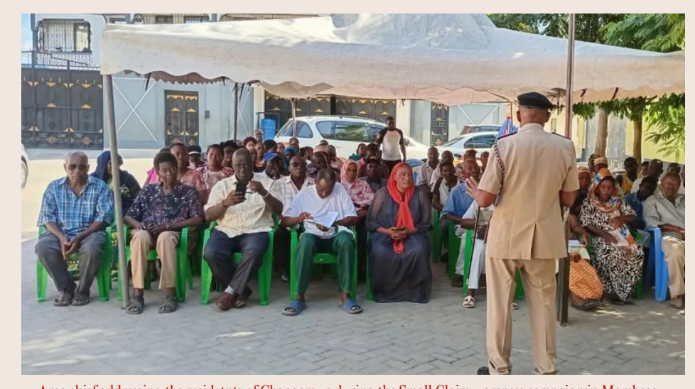
Area chief addressing the residetnts of Changamwe during the Small Claim wareness campaign in Mombasa County

On March 25, 2025, KITUO actively engaged in community chief barazas in the Nyali and Changamwe regions, aiming to educate local residents about the Small Claims Court and its jurisdiction. This outreach effort followed a series of training sessions for National Government Administration Officers (NGAOs), who play a critical role in administering and facilitating local governance. The chiefs raised concerns about the community's limited awareness of legal resources like the Small Claims Court, prompting KITUO to extend its educational efforts through these influential community forums.