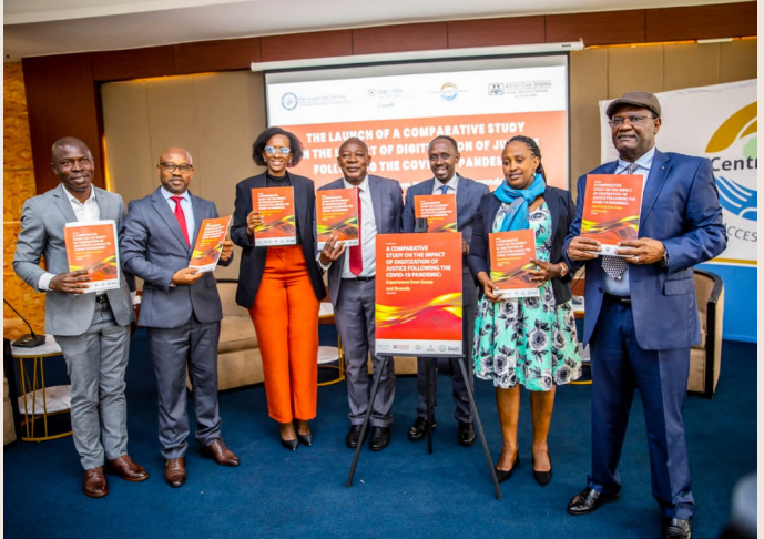
KITUO representatives and the Legal Aid Forum team displaying the newly launched study report in Kigali-Rwanda

The objective of the launch was to bring all the stakeholders in the research process to showcase and celebrate the achievements made. This also provided a good forum for the dissemination of all the research outputs. Given that the attendants came from far and wide it was an opportunity to share the hard copies which would reach in places where the populations are not accustomed to soft copies.