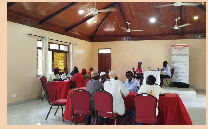
Volunteer Advocates Training session in Kwale

Alongside the training, KITUO hosted a legal aid clinic offering free legal advice and support to community members. This initiative reinforces KITUO's commitment to legal empowerment and ensuring that financial barriers do not deny anyone access to justice.