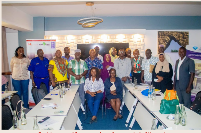
Participants posed for a group photo after a capacity building session

KITUO, in partnership with the Mombasa Small Claims Court, conducted a capacity-building session for chiefs, village elders, religious leaders, and police officers. This was made possible by the support from Embasy of the Netherlands in Kenya through UNDP Amkeni Wakenya. The training aimed to enhance their knowledge on the Small Claims Court and its jurisdiction while strengthening referral pathways among stakeholders. As the key community representatives and the first point of contact for many community cases, they are now better equipped to guide and refer the cases to the nearest community justice centre or our offices for appropriate legal assistance.