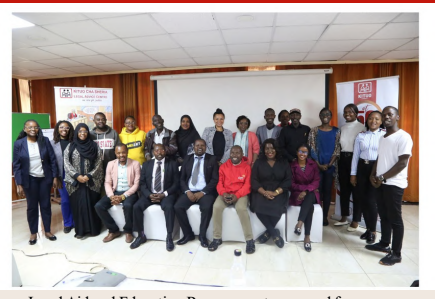
Legal Aid and Education Programme team posed for a group photo after training in Nairobi

leadership Kituo's expressed appreciation for IDRC's support and reiterated their commitment to evidence-based advocacy. They emphasized the importance sustained partnerships in scaling up innovative solutions that address systemic legal challenges. The concept of legal empowerment and research are the new approaches in the building community power and strategies to address justice issues across the region.