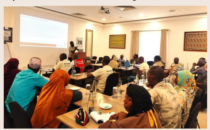
Capacity building session in progress at Kwale

Kituo Cha Sheria's efforts emphasize the critical importance of land as a foundational resource for community survival and development. Through this program, they are laying the groundwork for sustainable and equitable land management systems that will secure the future for generations to come.