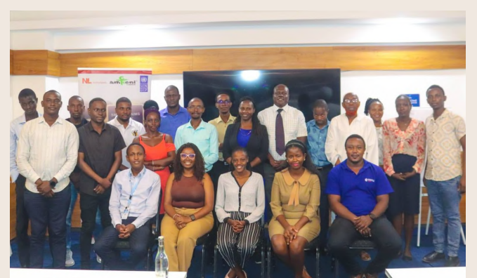
Participants posed for a group photo after the Small Claim Court reflection meeting in

To tackle these issues, participants worked together to develop a comprehensive action plan aimed at increasing public awareness and dispelling misconceptions about the Small Claims Court.